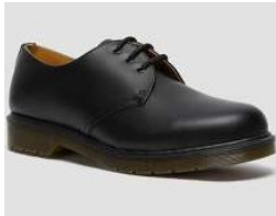
Plain Black School Shoes