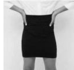
No tight skirts and not acceptable if above the knee