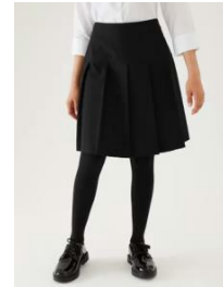
Skirt to the knee or below with black opaque tights