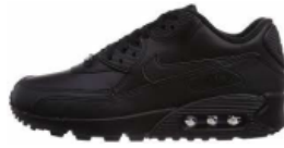
Trainers are not acceptable in any form