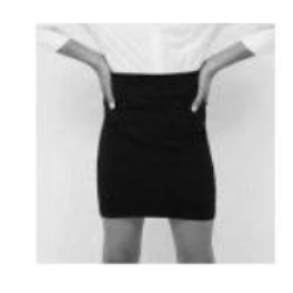
No tight trousers No tight skirts and not acceptable if above the knee